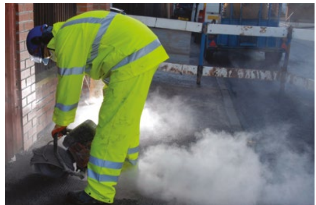
Figure 1 Common tasks like cutting can create very high dust levels

However, most of these diseases take a long time to develop. Dust can build up in the lungs and harm them gradually over time. The effects are often not immediately obvious. Unfortunately, by the time it is noticed the total damage done may already be serious and life changing. It may mean permanent disability and early death.