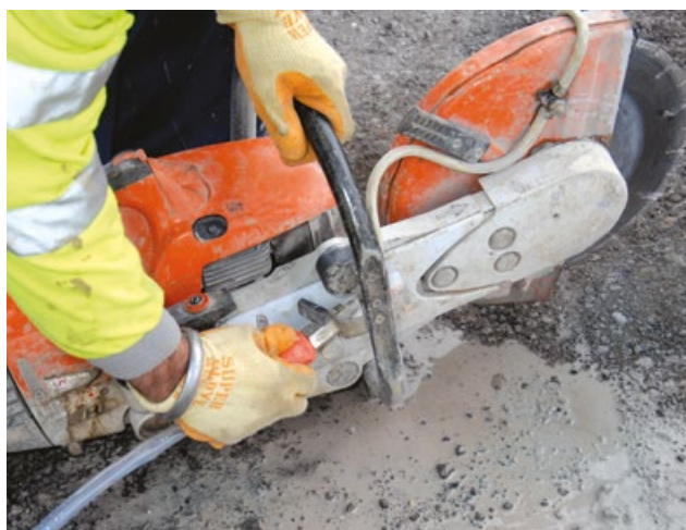
Figure 3 Water suppression on a cut-off saw